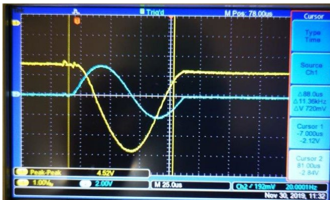
Figure 10: PK Vesp and Ipulse waveform. Vesp 14kV/1V, Ipulse 100A/1V

Below is example of PK waveform during the load operation.