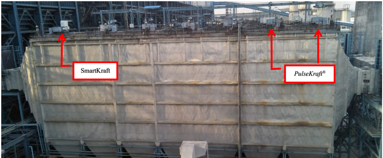
Figure 7: ESP view after PulseKraft® and SmartKraft installation are done.