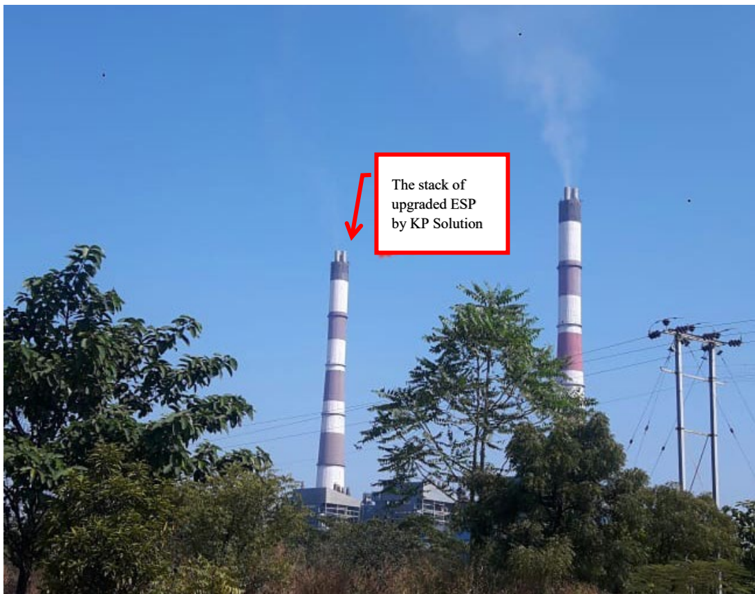
Figure 8: the obvious result of visible smoke at the stacks compared between the ESP which is upgraded by Kraftpowercon ESP solution and the one which is not.

This value shows by upgrading the existing PS to right sized combination of HVPS solution, more than 65% emission level can be gained. Since the plant requirement was fulfilled no more Emission reduction was not needed to keep the upgrade cost as low as possible. (Impact of Pulses on NO x is not measured)