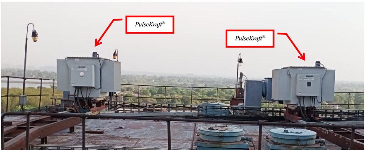
Figure 6: field 6 and 7 are equipped with PulseKraft®