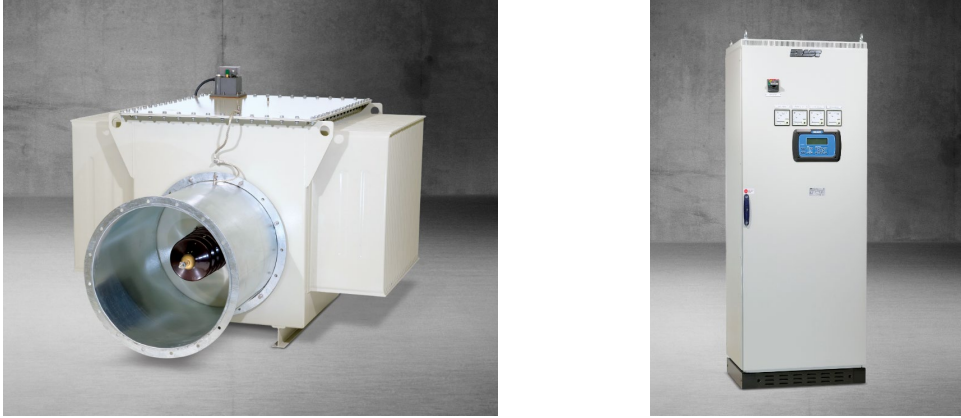
Figure 4: PulseKraft® TR and Control Cabinet Photos