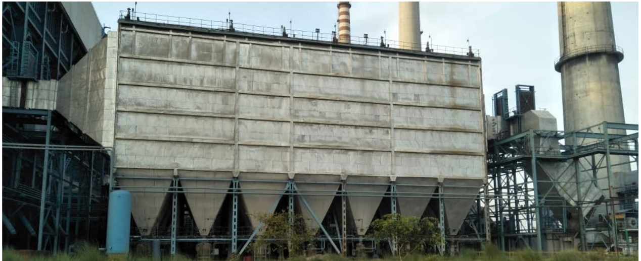
Figure 2: ESP photo from plant

Information on Electrical Upgrade with Advanced Technology HVPS.