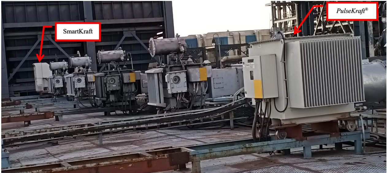
Figure 5: Power supply installation on field 1-6 out of 7 fields. SmartKraft is in field 1 and field 6 is equipped with PulseKraft®